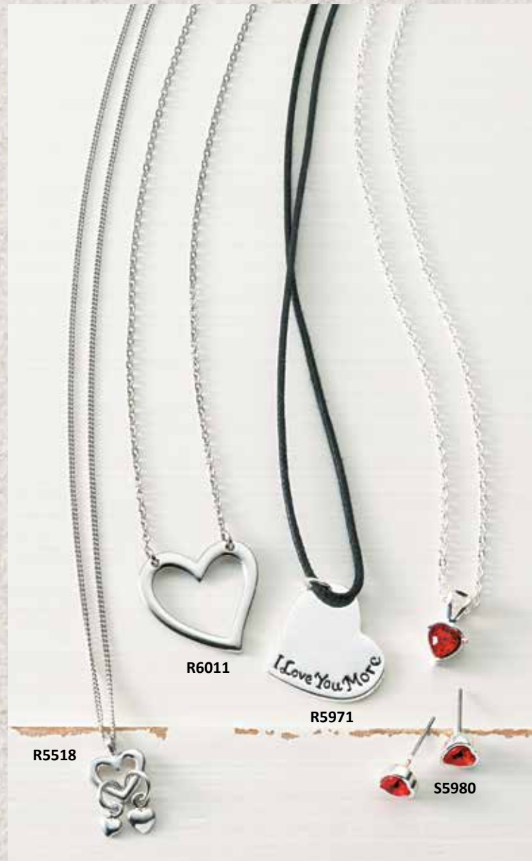
R5518 HEART CHARMS NECKLACE Collar con pendientes de corazones Express your love with this rhodium-plated open heart necklace featuring two smooth puffed heart charms. 15" chain. Single heart drop with charms 3/4". $17.50

All jewelry is manufactured without lead and nickel.