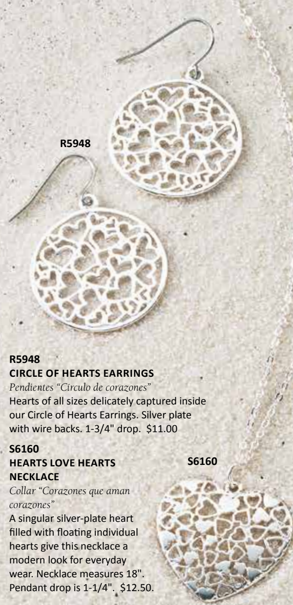
R5948 CIRCLE OF HEARTS EARRINGS Pendientes "Círculo de corazones" Hearts of all sizes delicately captured inside our Circle of Hearts Earrings. Silver plate with wire backs. 1-3/4" drop. $11.00