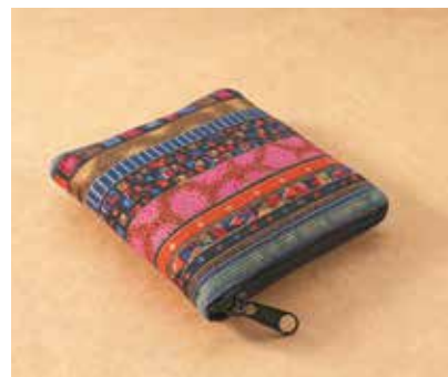
A7467 FOLD DOWN SHOPPING TOTE Bolsa de compras plegable Generously sized reusable tote holds groceries or purchases, folds up into an amazingly small packet for easy packing. Zipped, 4-1/2" Sq. Unzipped, 16" H with 9" H handles. $19.50

The products featured on these 2 pages have been handcrafted at Project Centers in Thailand and China. Primarily women, workers at the Project Centers seek to rise above their circumstances of disease, hunger, poverty, strife, oppression, and even exploitation. The Project Centers offer clean and sanitary working conditions, health care assistance, and a commitment to provide sustainable income that literally transforms their lives. Our goal is to find those who may be overlooked by others and give them hope and a future!